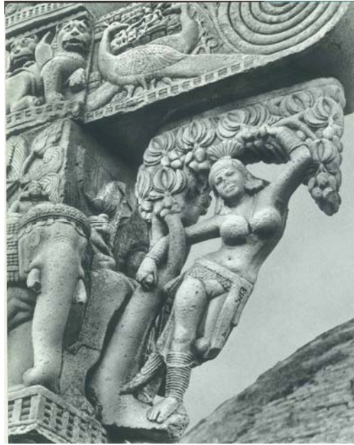
Fertility goddess on the East Gates at Sanchi, 1 st century BCE