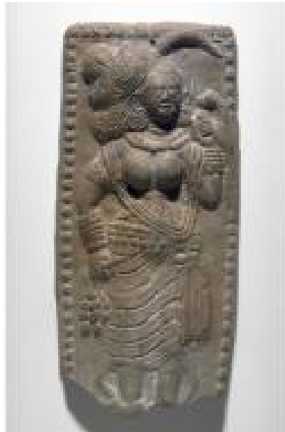
Goddess from West Bengal, made more than 1,500 ears ago

foods for the rituals. They went to the large communal baths found in Mohenjaro and Harappa, that once had a combined population of 40,000. There is a lot to learn about these goddesses. Many of the delicate ancient goddess images are in museums around the world since they are so precious. In the collection of the Asian Art Museum of San Francisco, there are several goddess images on display.